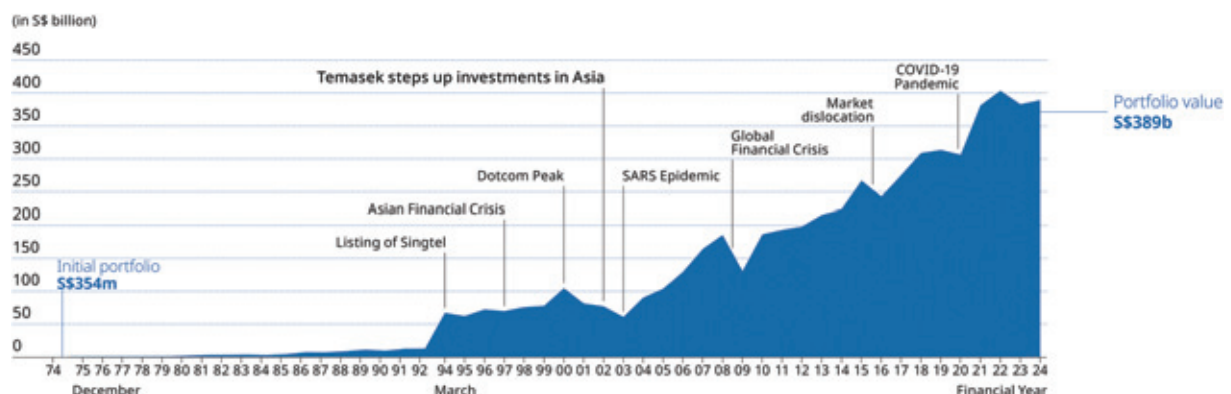
Temasek's Net Portfolio Value since Inception

The following chart provides additional information about Temasek's Net Portfolio Value since Temasek's inception in 1974.